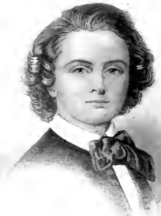
HARRIET G. HOSMER.

HOSMER, Miss Harriet G., sculptor, born in Watertown, Mass., 9th October, 1830. Her father was a physician. Her mother and sister died of consumption, and Harriet was led to live an outdoor life. Her genius for modeling in clay showed itself in her youth, when in a clay-pit near her home she spent her time in modeling horses, dogs and other forms. She received a fair education and took lessons in art in Boston. With her father she studied anatomy, and afterward went to St. Louis, Mo., where she took a course of study in the medical college. In 1851 she executed her first important work, an ideal head of "Hesper." In 1852 she went to Rome, Italy, with her father and her friend, Charlotte Cushman. There she was a pupil with Gibson. She at once produced two ideal heads, "Daphne" and "Medusa," which were exhibited in Boston in 1853. In 1855 she produced her first full-length marble figure, "Æone." Her other productions include "Will-